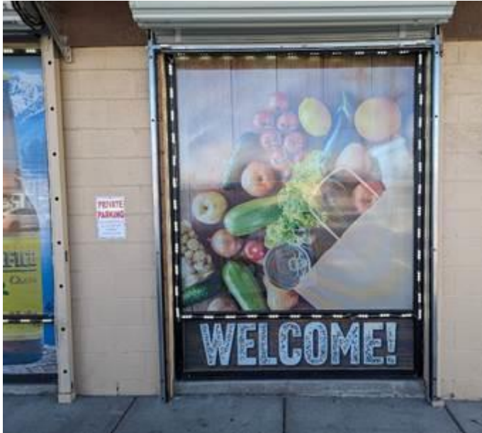
Image of the revamped store window at Vassar Market