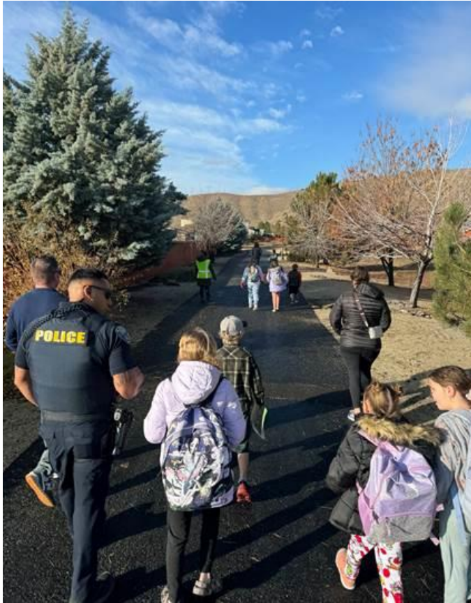
Image of Cold Springs students walking with school police and volunteers