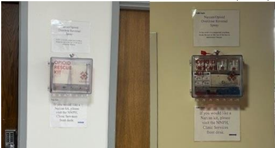
Images of the two mounted Naloxboxes